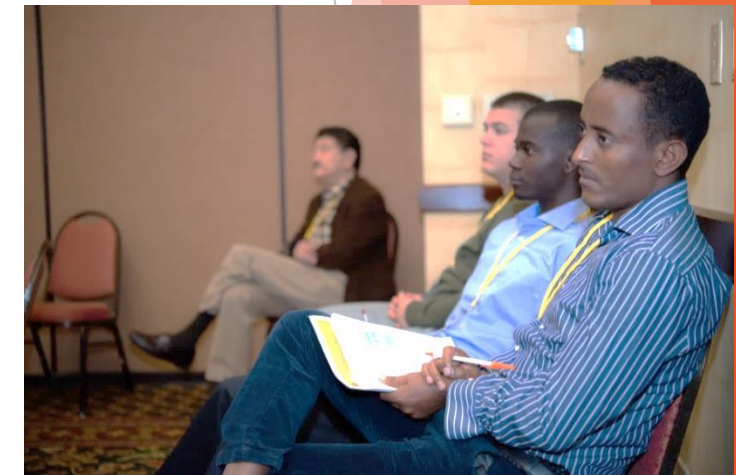
New Mexico First's 2016 Statewide Town Hall on Economic Vitality