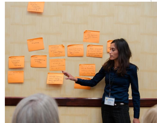
New Mexico First's 2016 Statewide Town Hall on Economic Vitality