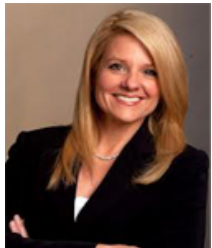
Gwynne Shotwell SpaceX, $1.5 billion Grasshopper – VTVL Spaceport America Test Program